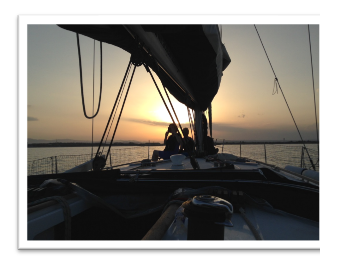
Reflections at sea...