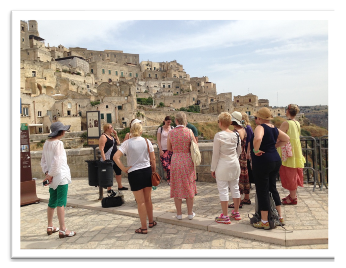
Visit in Matera, one of the oldest cities in the world.